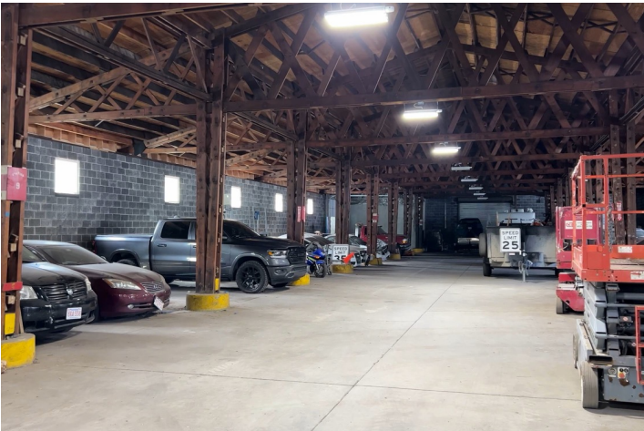
Comprehensive LED lighting retrofit to achieve 100% LED conversion, installed insulation, HVAC system with heat pumps at training facility