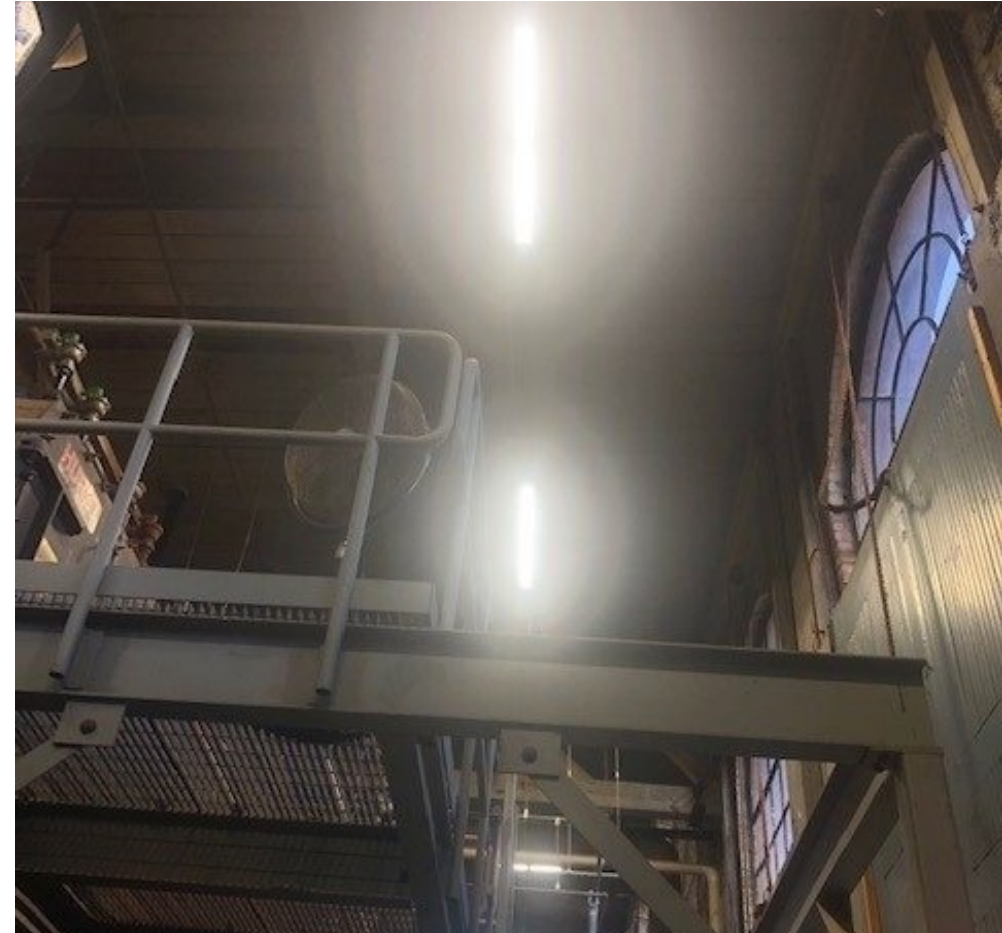
LED lighting with controls installed at Zambarano Hospital