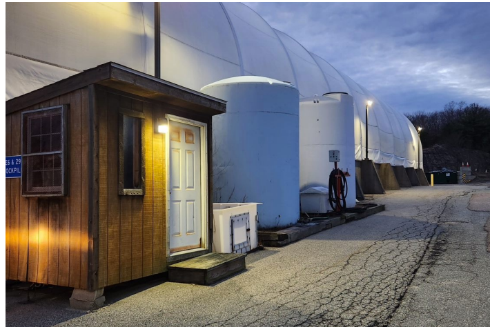
LED lighting & controls at Highway Maintenance Office and Service Garages