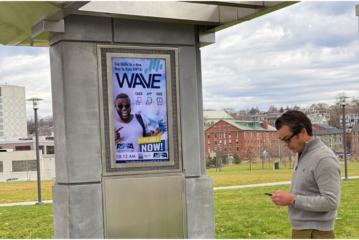
RIPTA invested in electric fleets, established new clean transportation options