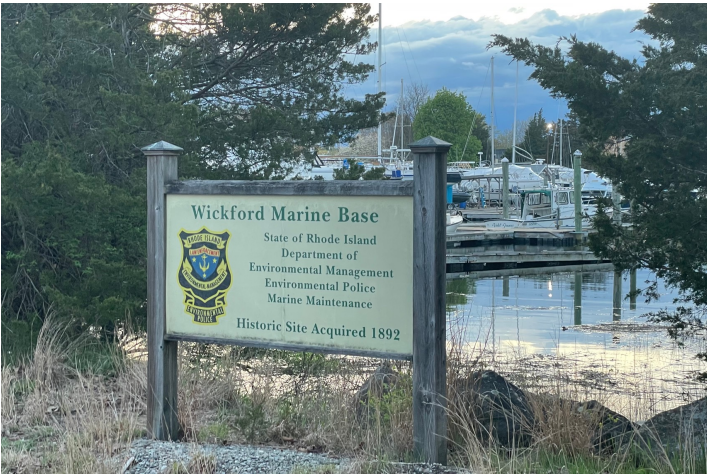
LED lighting and controls installed at DEM Marine Station