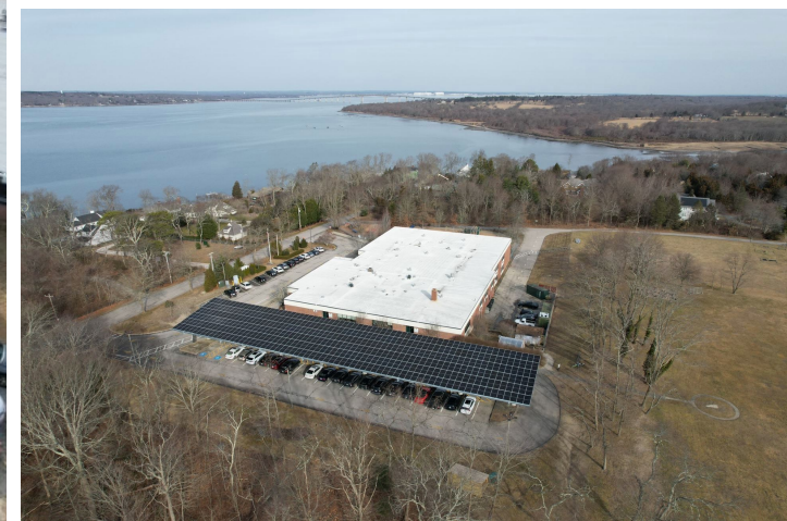
Installation of roof and carport solar systems at two Jamestown's schools