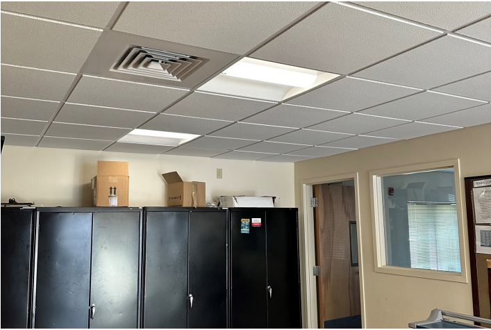
LED lighting with controls installed at 4 facilities