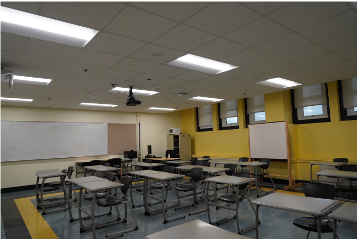
Installed LED lighting and controls at Central High School