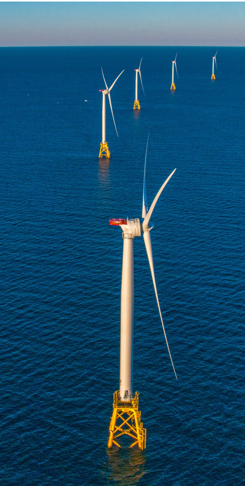
Workforce Development Initiative supporting the offshore wind industry