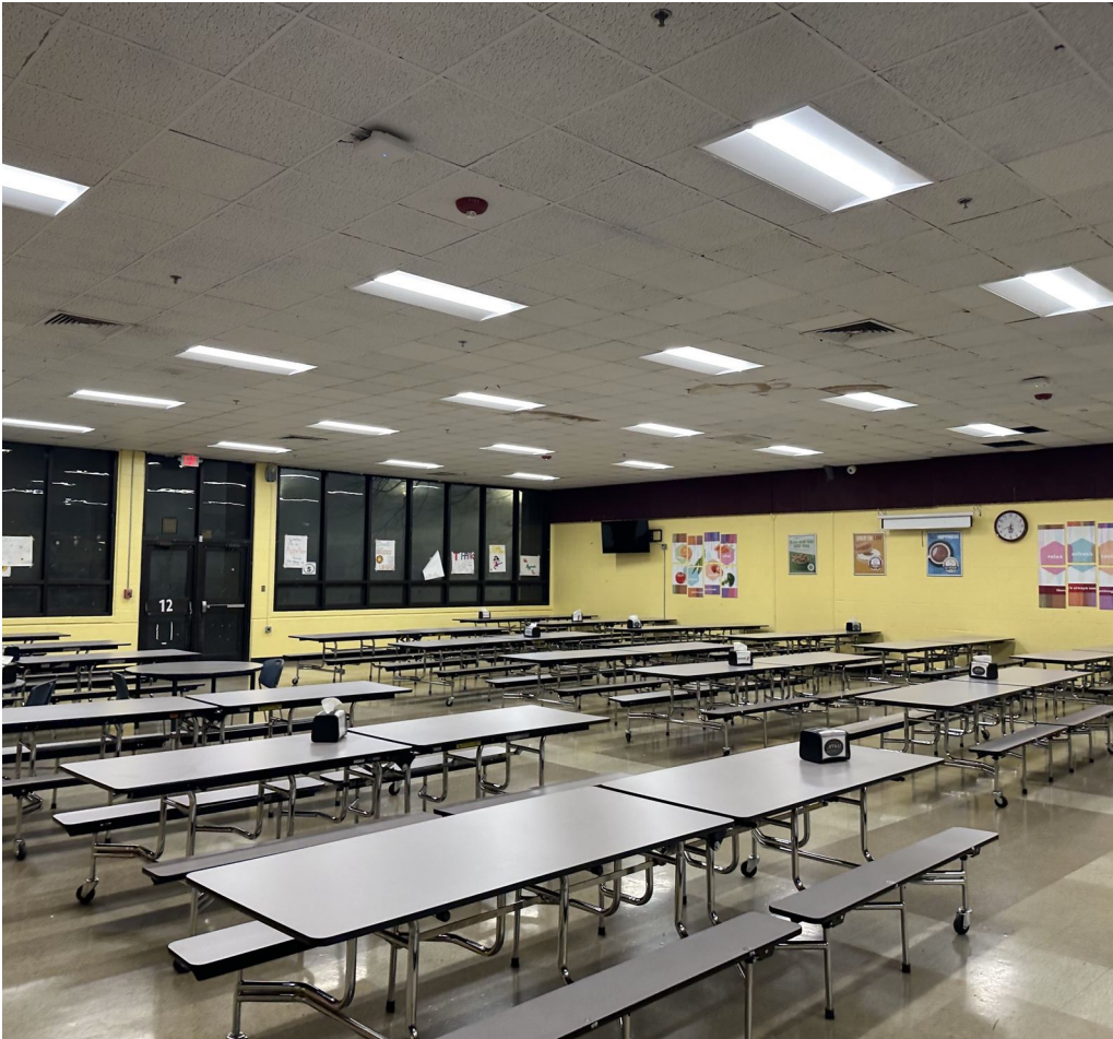
LED Lighting and controls upgrades were made in 5 schools