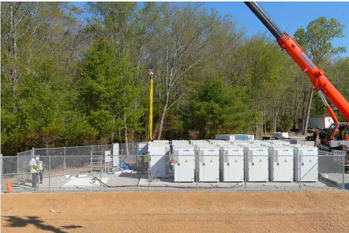
Installation of a 3MW/9MWh grid-scale battery storage system