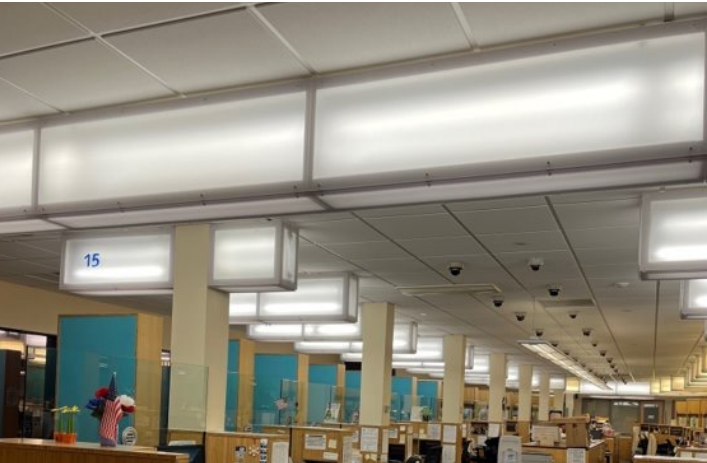
LED lighting & controls upgrades at 3 buildings; Heat pump hot water heaters – Capitol Hill Buildings